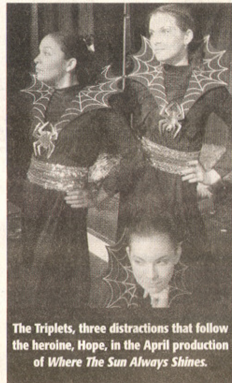
The Triplets, three distractions that follow the heroine, Hope, in the April production of Where The Sun Always Shines .